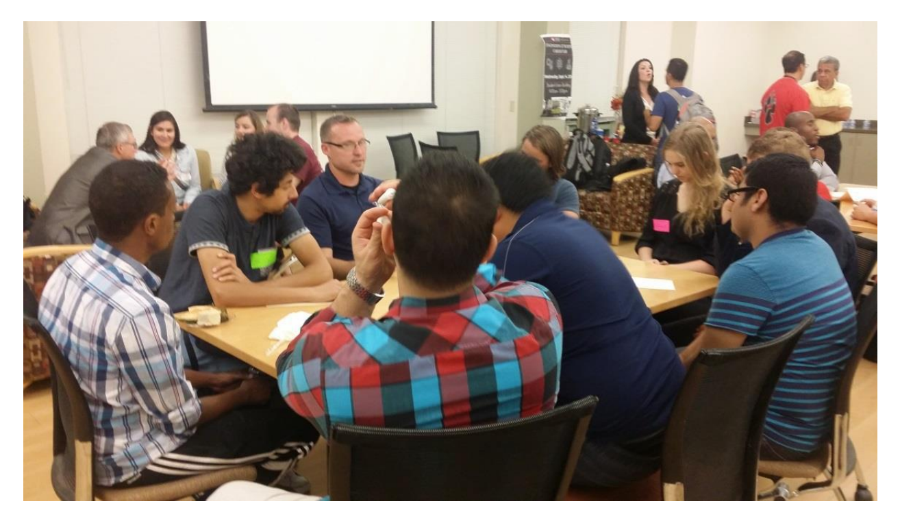
Figure 2. INDUSTRY NETWORKING SOCIAL: September 13, 2016