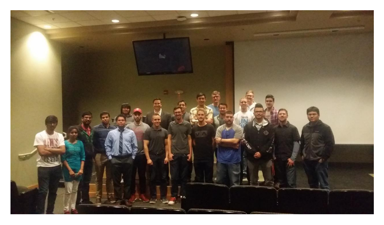
Figure 3. Seminar on "Publishing, Patenting, and Start-ups" presented by the New Mexico Society of Professional Engineers: March 23, 2016.