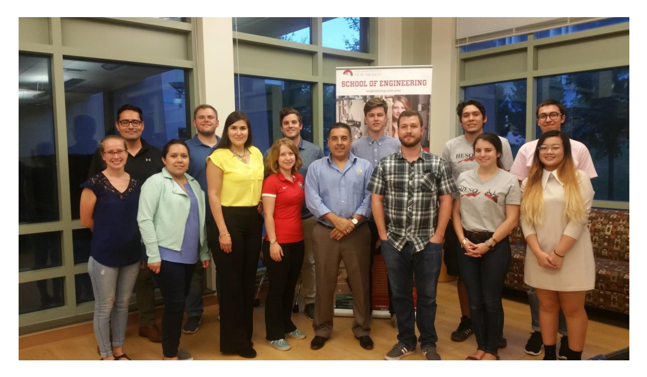
Figure 4. NSF Scholars meeting former NASA Astronaut Jose Hernandez (Center): October 3, 2018