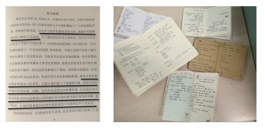
Figure 4. Some intership summaries from students